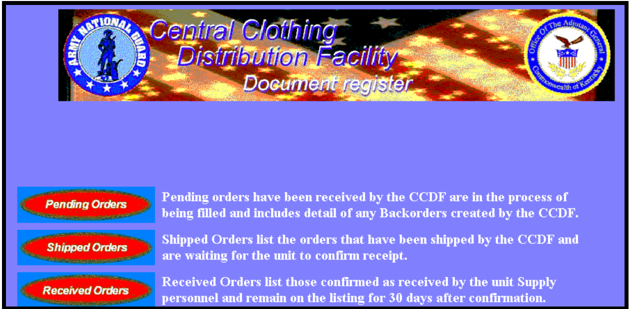
Figure 2-1. Document Register Home Page