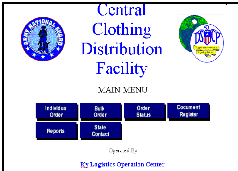
Figure 3-1. CCDF Main Menu